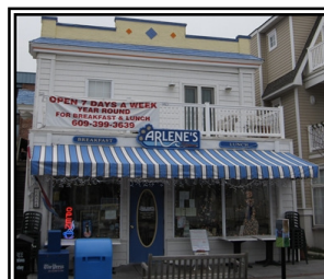
Arlene's on Asbury