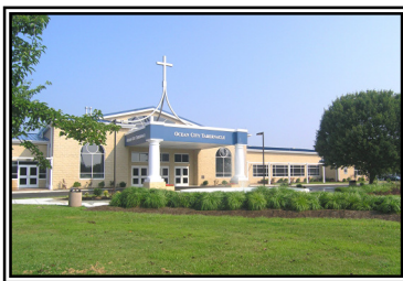
Ocean City Tabernacle