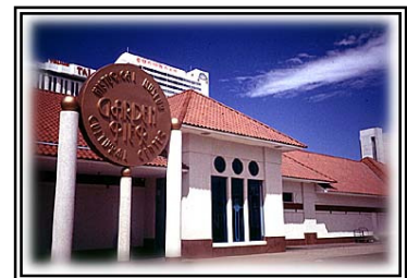
A. C. Historical Museum & Art Center